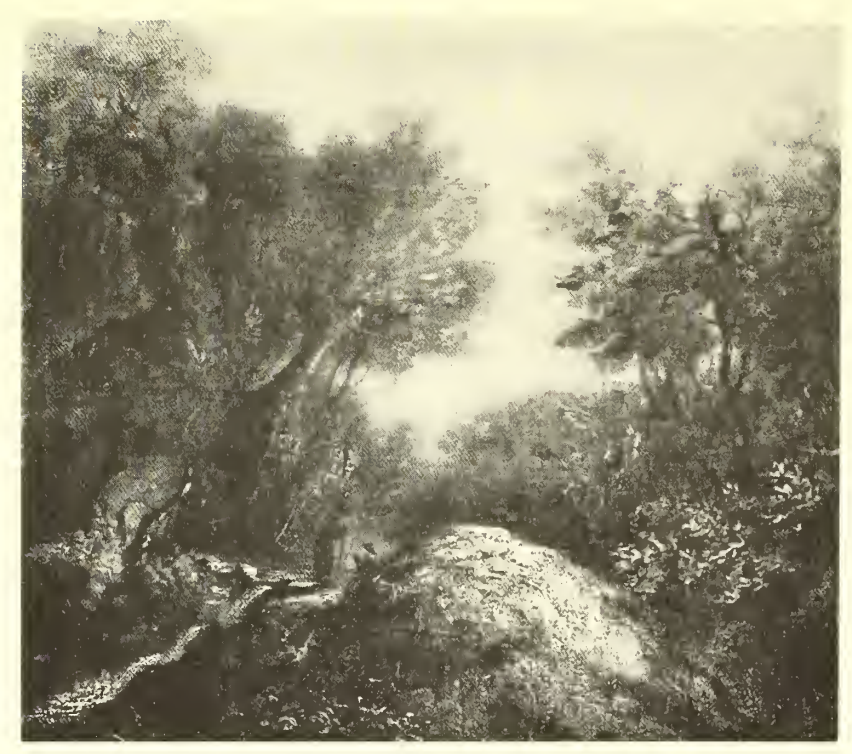
No. 3 VIEW NEAR BATH